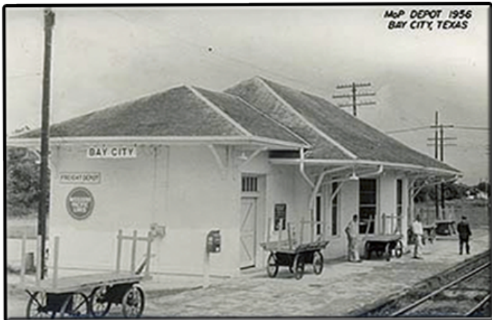
MoPac Depot 1956- Bay City, Texas

Brochure Courtesy of the Matagorda County Historical Commission